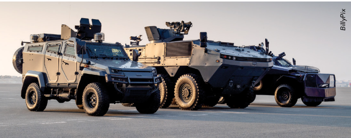
Otokar is at the show displaying its ARMA 6x6, COBRA and URA vehicles at the show

The listed NATO and United Nations supplier manufactures a range of defence industry products including 4x4, 6x6, 8x8 tactical wheeled armoured vehicles, tracked armoured vehicles, unmanned armoured vehicles as well as turret systems, using its own technology, design and applications. Its products are recognised for their survivability, superior mobility and modularity.