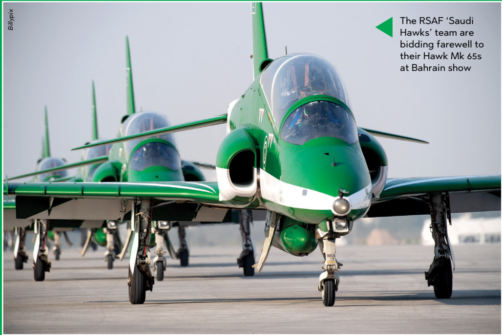
The RSAF 'Saudi Hawks' team are bidding farewell to their Hawk Mk 65s at Bahrain show

With its rocket assisted take off the Mirsad 1 is being launched by militias from safe distance, and with a forward looking infra-red camera can send intelligence back to the militia commander. Just behind the camera is a warhead packed with TNT that can make a significant impact if used for offensive operations. It all helped to illustrate the threats that Bahrain and its GCC allies face in this uncertain world.